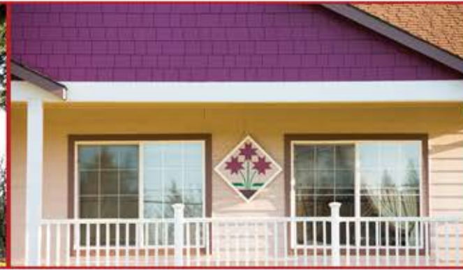
This floral inspired block can be seen at #47 on 626 SE Forest Ln.