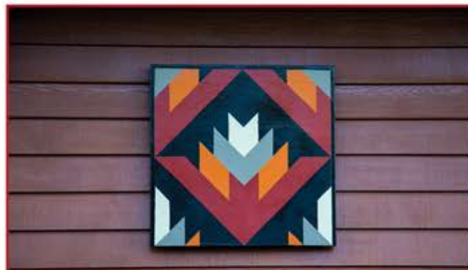
This beautiful Magnolia quilt block can be seen at #39 on 15 E Bailey Gatzert.