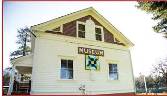
This colorful quilt block can be seen at #9 at the Historical Museum in Marine Park.