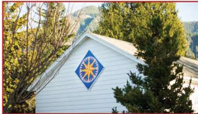
This Mariner's Compass inspired quilt block can be seen at #39 on 440 SW Forest Ln.